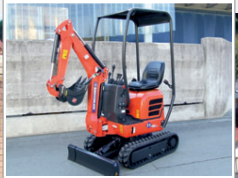
Optional: 4 columns Canopy