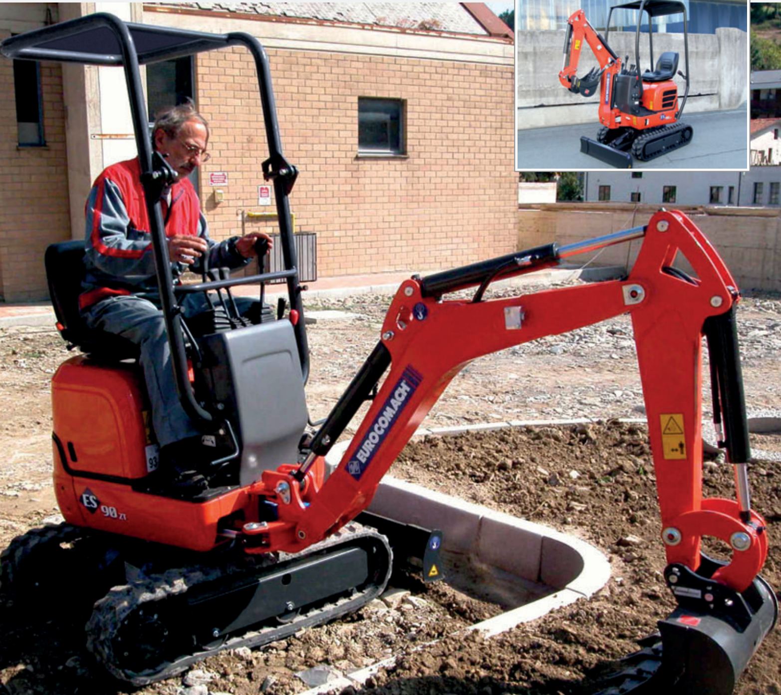
Optional: 2 columns Canopy (folded)